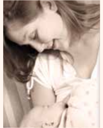
Nurse often when you and your baby are together.